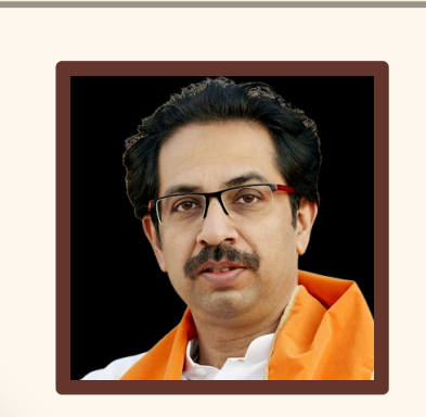
Shri. Uddhav Thackeray Hon'ble Chief Minister